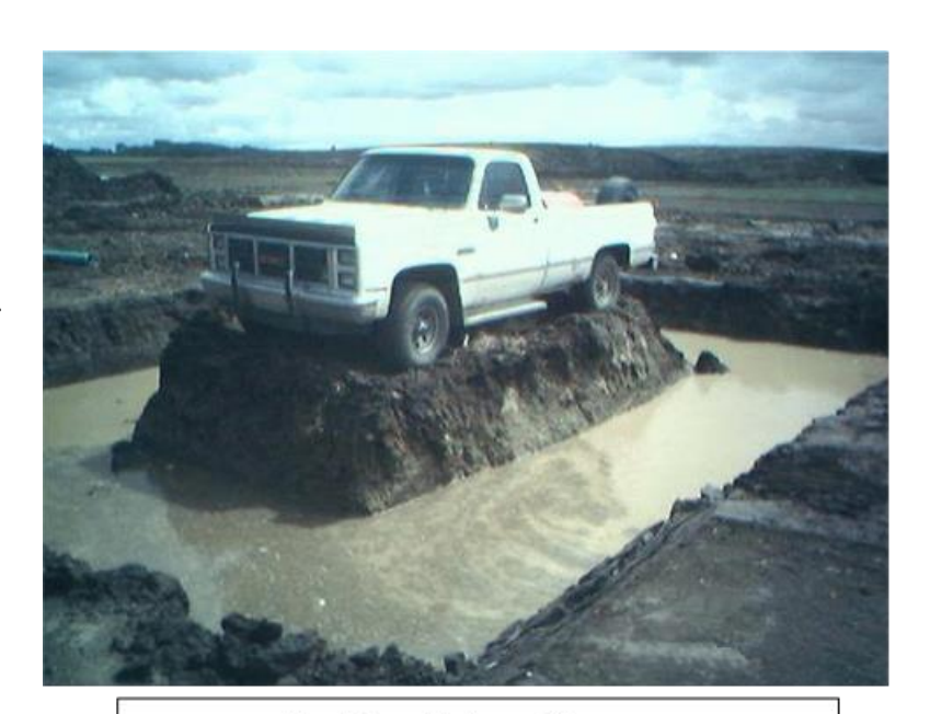
Backhoe Drivers Revenge

ScoMo and Albo somehow ended up at the same barbershop. As they sat there, each being worked on by a different barber, not a word was spoken.