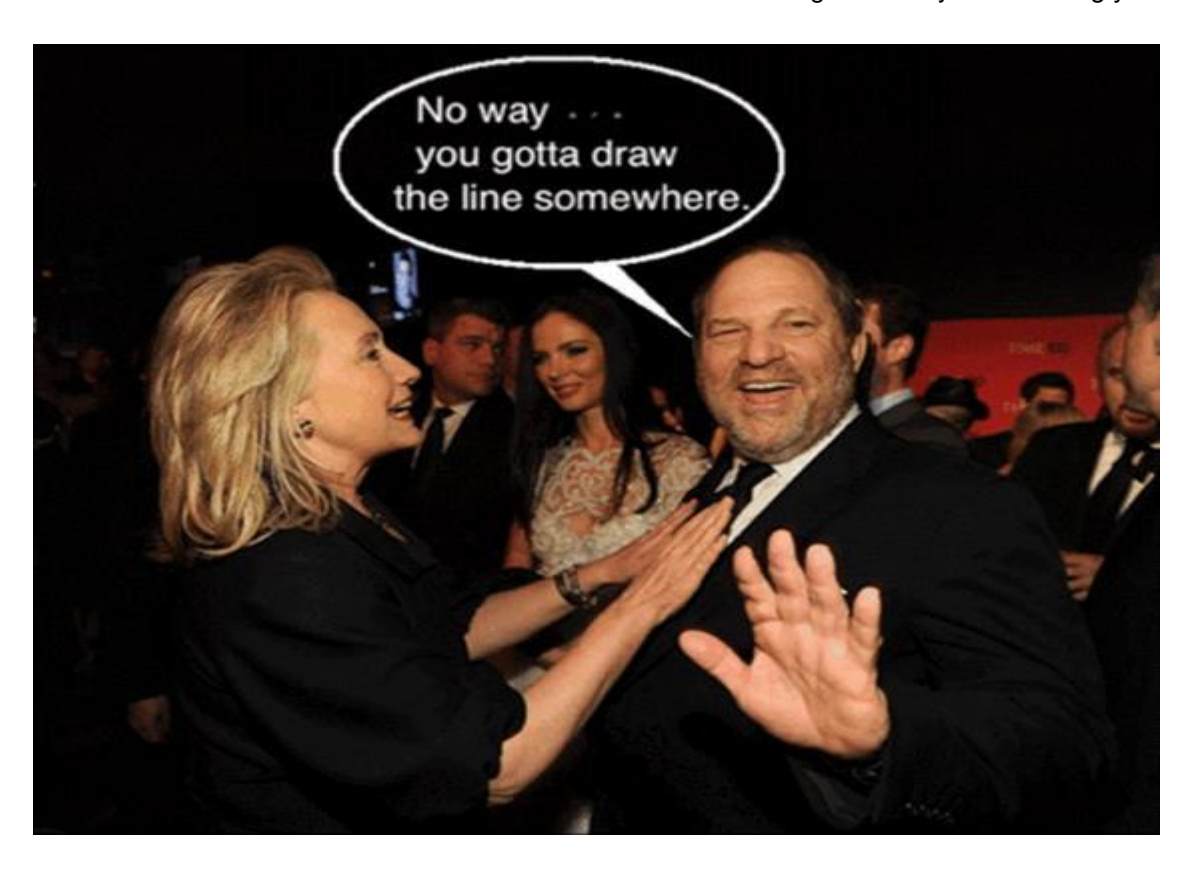
Why women hate to take men on vacation