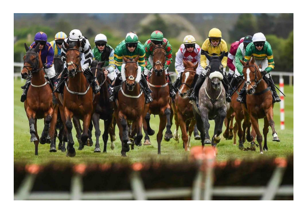
RANDWICK RACES – 18<sup>ST</sup> SEPTEMBER 2021