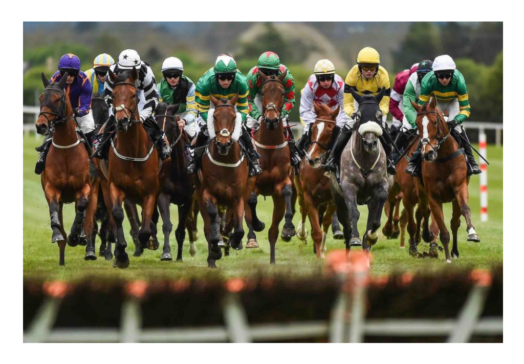
RANDWICK RACES – 11<sup>th</sup> DECEMBER 2021 – VILLIERS STAKES

Dinner afterwards at Isabella's Italian & Seafood Restaurant, 183 Alison Road, Randwick -