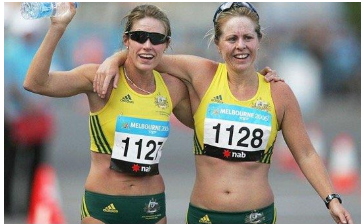
SAVILLE SISTERS, JANE (GOLD) AND NATALIE (SILVER) AFTER THE 20KM WALK AT THE 2006 COMMONWEALTH GAMES IN MELBOURNE