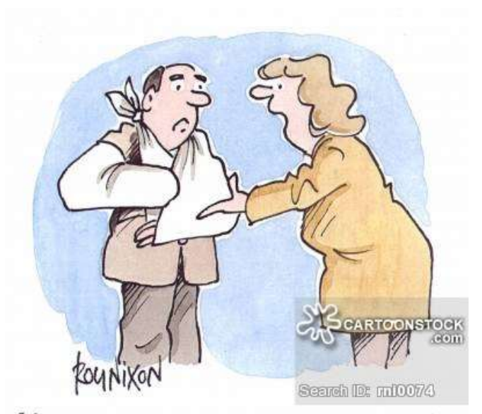
"I'VE ONLY JUST HEARD ABOUT YOUR ACCIDENT. WHY DIDN'T YOU WRITE?"