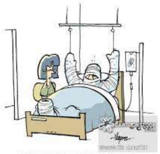
I GOT TWENTY DOLLARS FOR YOUR MOTORBIKE, IS THAT GOOD?