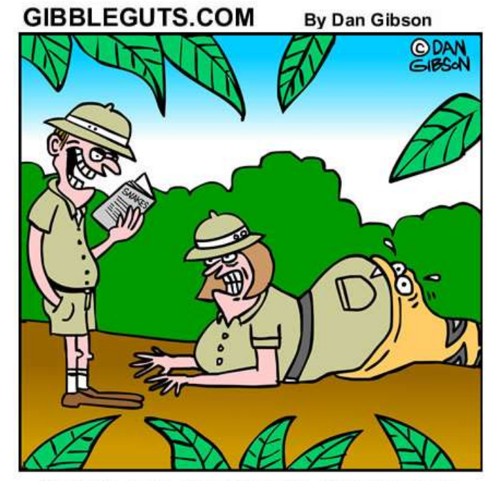
You're in luck... Says here the giant Anaconda can't swallow anything larger than a Yak.