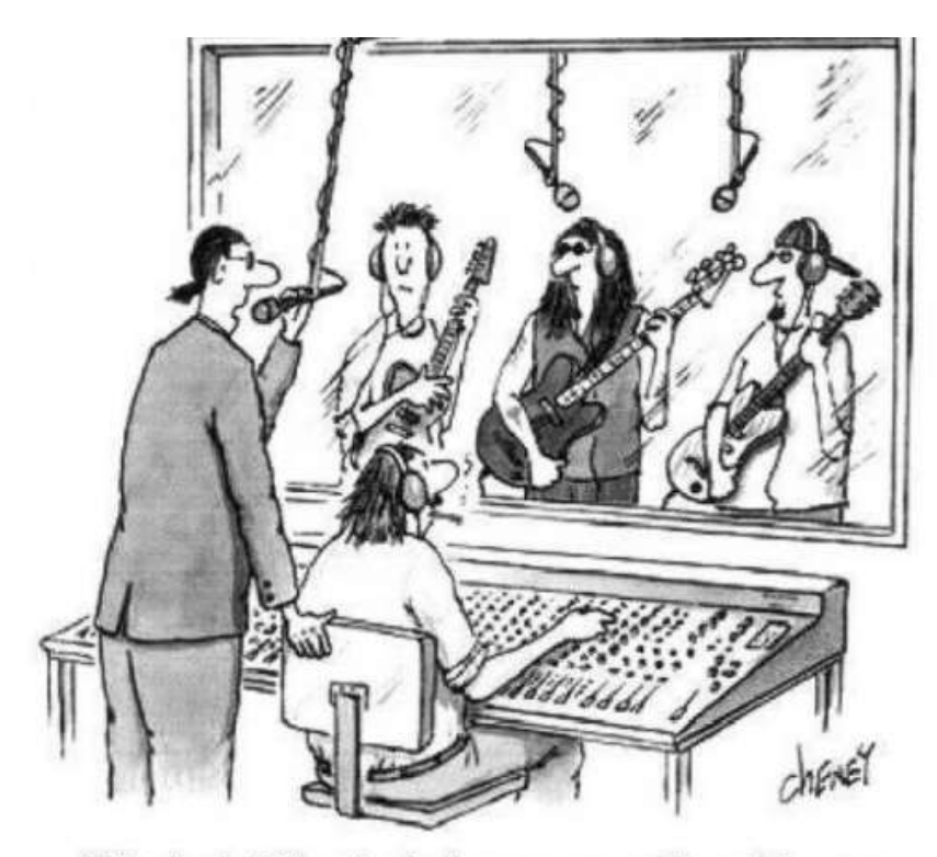
"Not bad, fellas. Let's do one more take, with more emphasis on tone, harmony, melody, rhythm, composition, lyrics, musicianship, tempo, and originality."