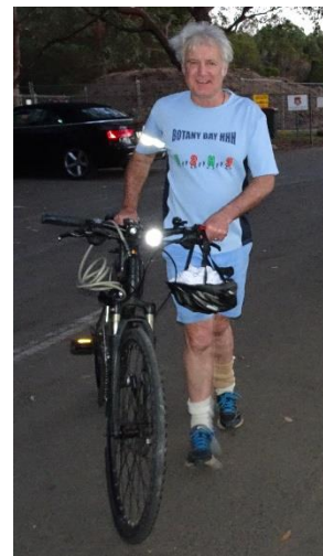
Ringless rode the trail?