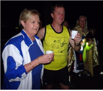
Prickette & Prick & The RA