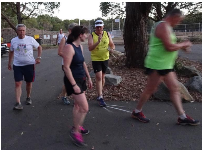
Pig leads the pack in