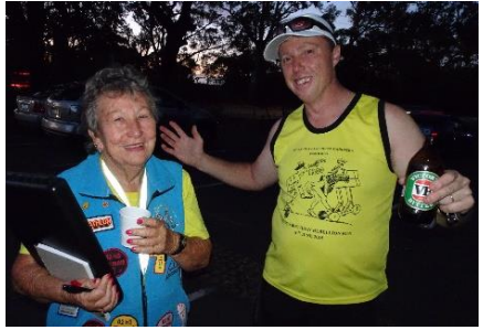
Honestly my????? is this big Holey!