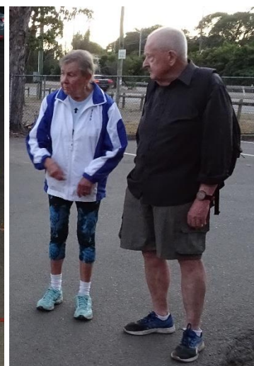
Bowerbird & Meltdown