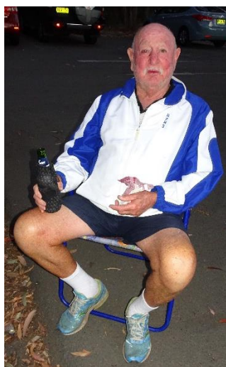
Cannon takes it easy