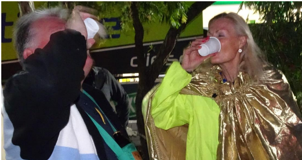
Not too sure why these two are having a down down