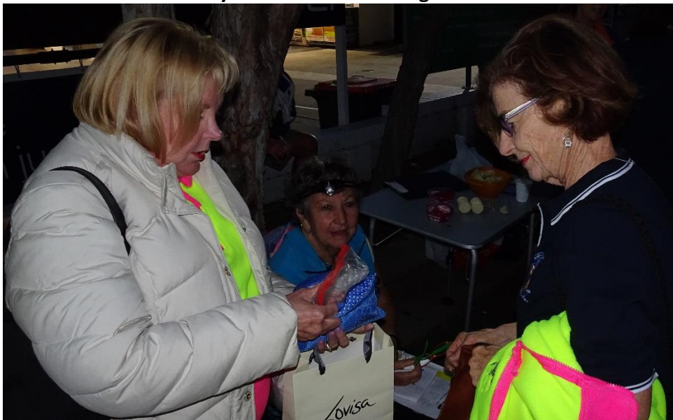
Dirty Weekend showing Venus the Hash Cash ropes