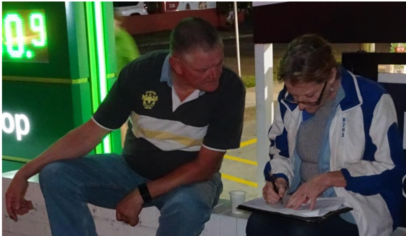
Pig, this is how you chase up hares, just put them on a list & let them sort themselves out!