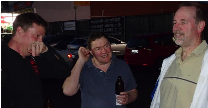
Phew! Growsome it MUST be you, 3 photos do not lie!