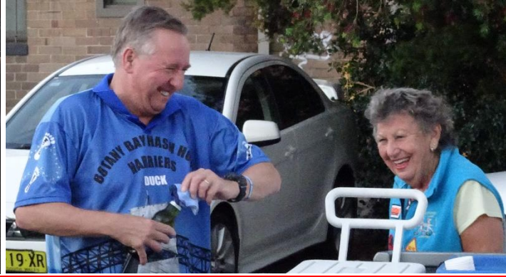
Really Duck, you expect me to believe that?