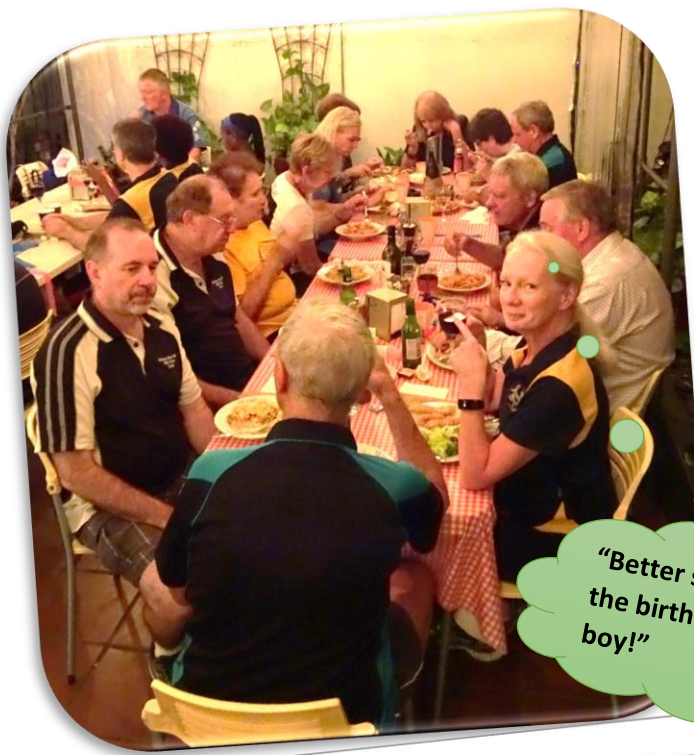
"Better smile for the birthday boy!"