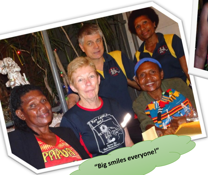
"Big smiles everyone!"