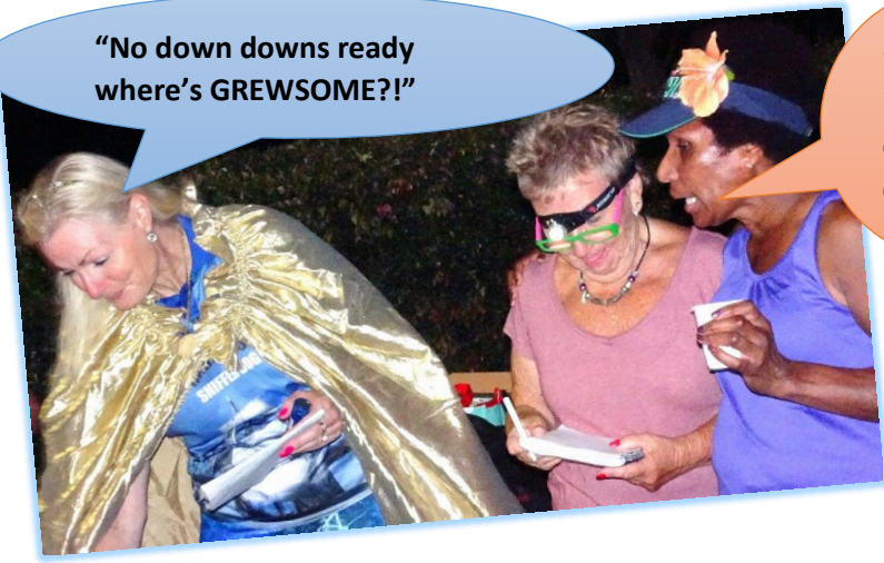
"I thought it was BYO down down!"