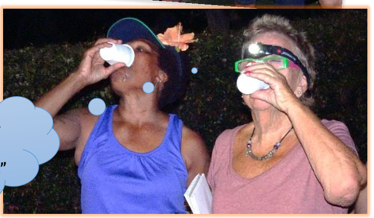
"That's better thanks GREWSOME!"