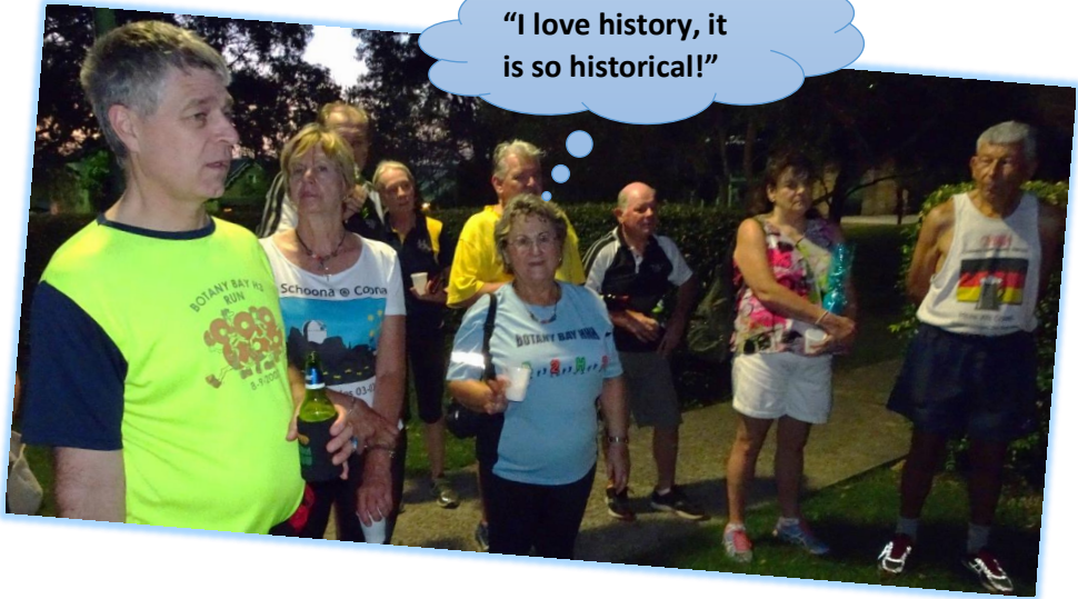
"I love history, it is so historical!"