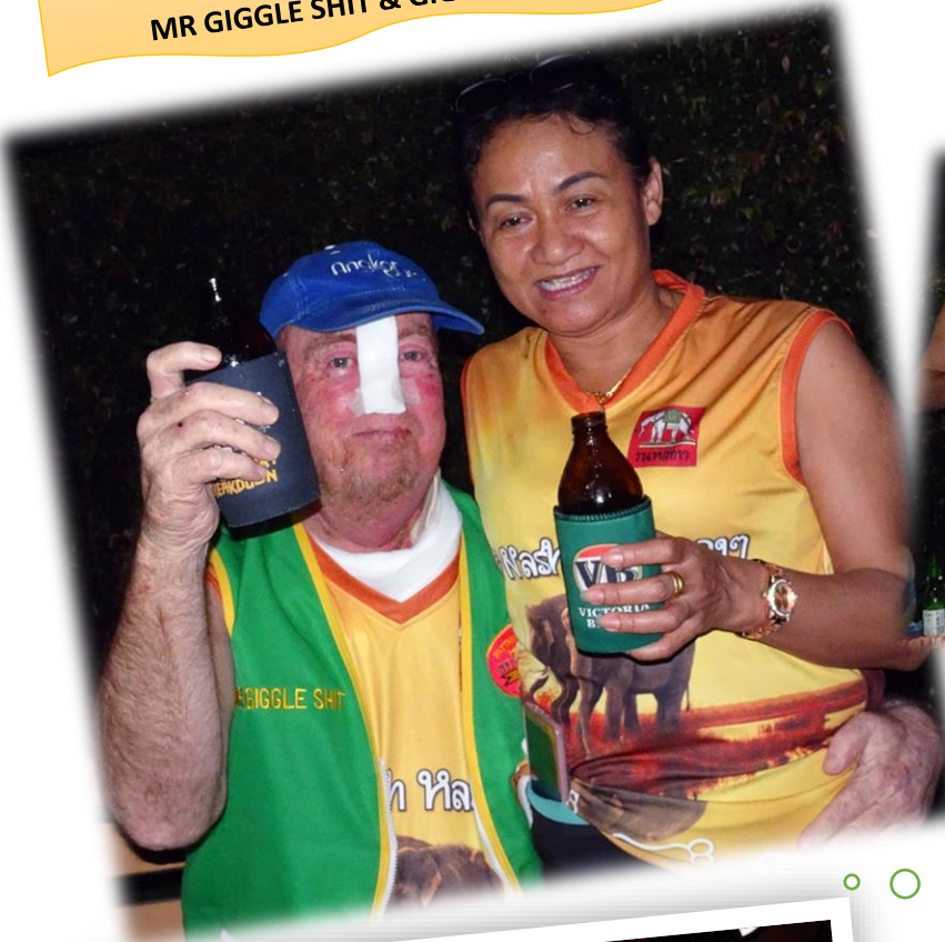
Two of our visitors MR GIGGLE SHIT & GIGGLE TITS