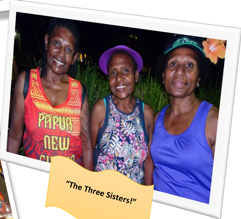
"The Three Sisters!"