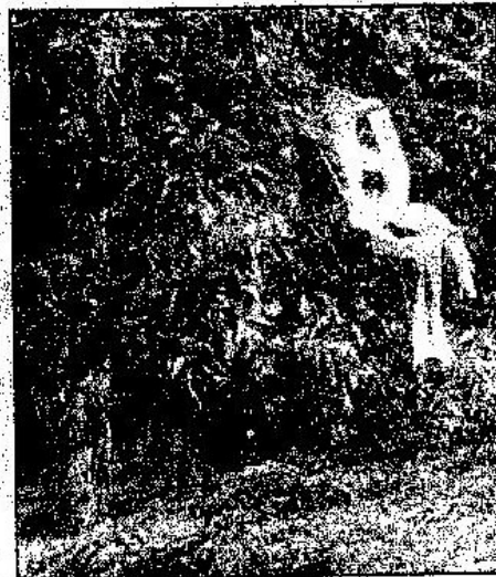
LITTER BUGS: Toilet paper marks a running trail.

"Anyone found dumping any type of rubbish in public parks is liable to heavy fines, and we are asking members of the public to contact Brisbane City Council if they know the name of the run-